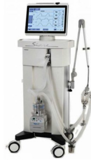
Intensive Care Ventilator Italy