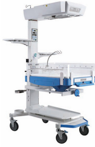
Infant Baby Rescitaire