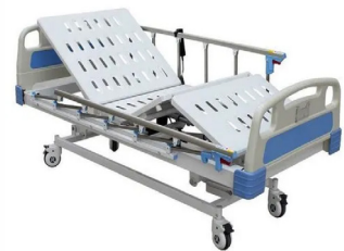
Electric Hospital Beds SK006