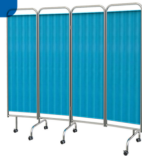
Ward Screen 4 Folds Stainless Steel