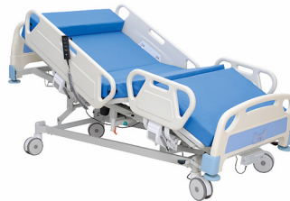
ICU Electric Bed SK006-1