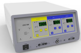
Infusion / Syringe Pumps