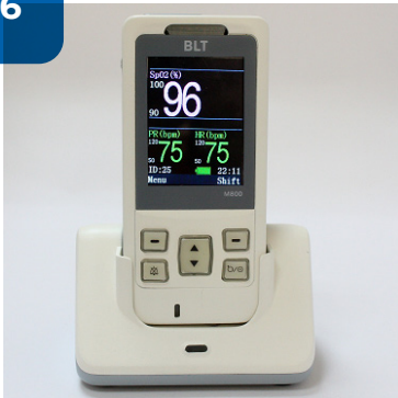
Handheld Pulse Oximeter