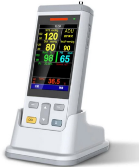
Handheld Vital Sign Monitor