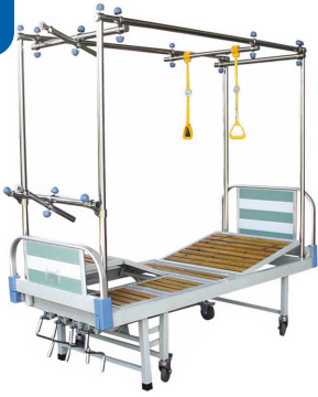
Orthopedic Traction Bed G05