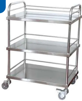
Instrument Trolley 3 Layer