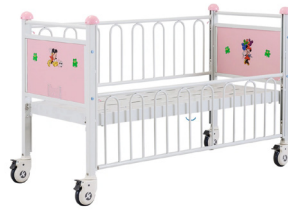
Baby Cot CR0Q SK-A2