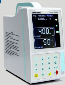
Infusion/ Syringe Pumps