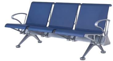
Waiting Seats SKE008-1