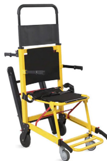
Electric Staircase Wheelchair SKB1C02-2