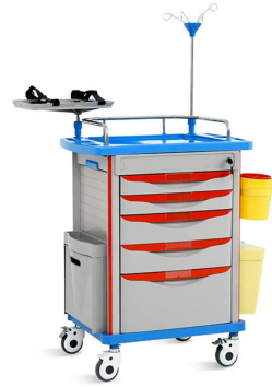
Crush Cart / Emergency Trolley SKR054