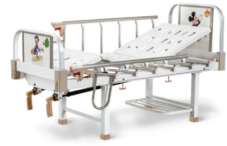
Hospital Baby Beds SK-C2