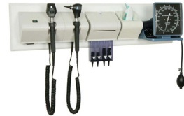
Wall Diagnostic Set