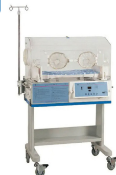
Infant Baby Incubator