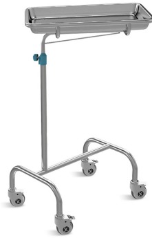
Stainless Steel Mayo Trolley SKH038-2