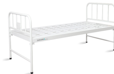
Manual Single Crank Stainless Steel Bed with Castors