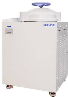
Autoclave Machine 100L