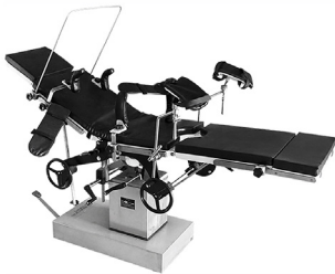
Multi-Purpose Operating Table