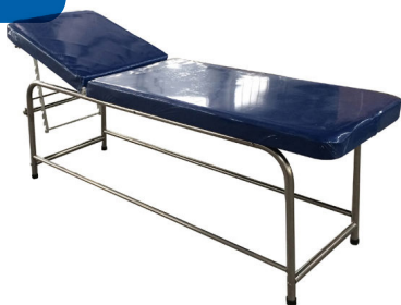
Examination Couch X10