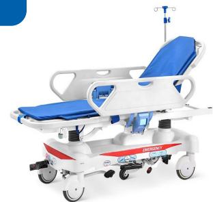
Patient Transportation Trolley SKB041-2