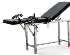
Gynecological Examination Bed