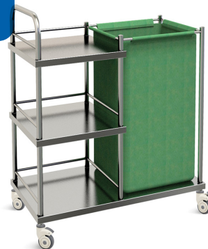
Laundry Trolley SKH042