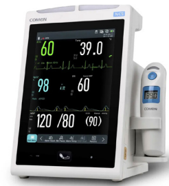
Vital Sign Monitor NC5