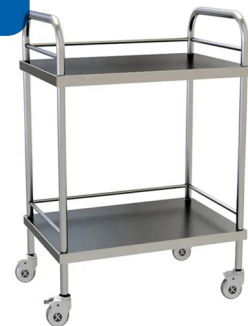
Instrument Trolley 2 Layer SKH006