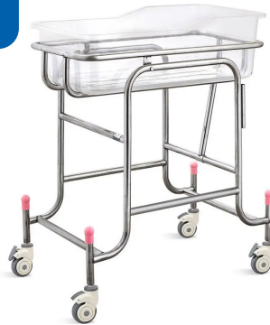
Baby Bassinet X01