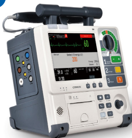
Defibrillator for ICU