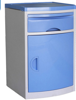
Bedside Cabinet SKS002