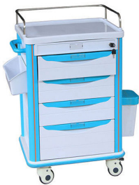
ABS Medicine Trolley SKR032