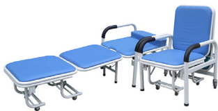
Waiting Seats SKE008-1