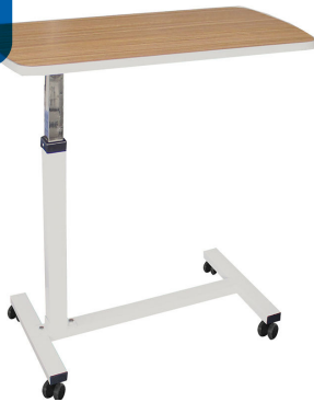
Hospital Feeding Table SKH042