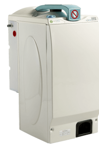
Placenta Macerator Verrna Care