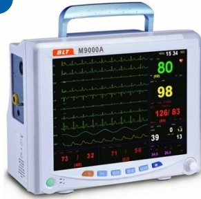
Patient Monitor with a Trolley