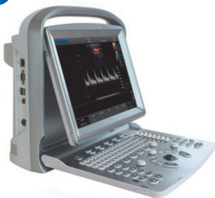
ECO 5 Portable Ultra Sound Machine