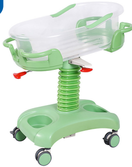
Hydraulic Baby Crib SK-AD