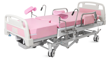
Electric Delivery Bed