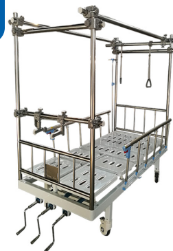
Orthopedic Traction Bed C04-1