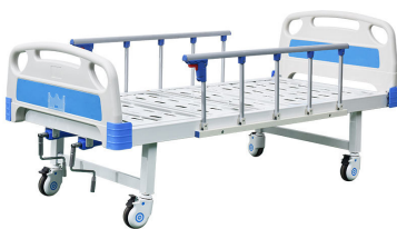
ABS Manual Single Crank Beds