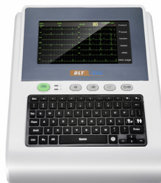
ECG Machine 12 Channel